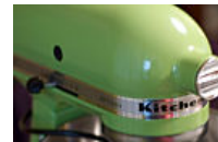
Must Have Appliances Being sold For Next ... QuiBids