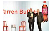
Warren Buffett Tells You How to Turn $4... The Motley Fool

Lansing State Journal SUBSCRIBE NOW! Save 50% on Digital Only Subscription for 6 months. Act now and save.