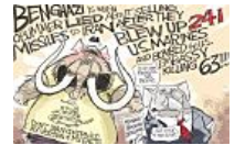
Editorial cartoons May 9